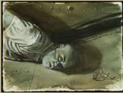
Self Portrait, Dead, 2003, sumi on paper, 23 x 30 inches

Arkansas Arts Council Fellowship Award Exhibition Gallery I, University of Arkansas at Little Rock May 19 - July 3