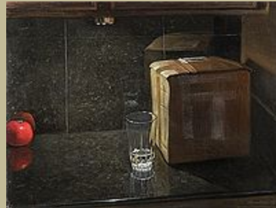
Olive Oil, 2004, acrylic & oil on linen, 24 x 32 inches

January 20 - February 20, 2005 Curated by Barbara Satterfield