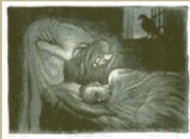
Death Waking Time, 2000, linocut