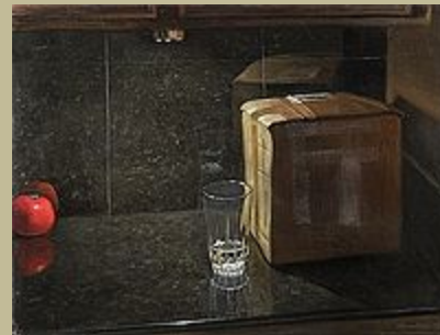
Olive Oil, 2004, acrylic & oil on linen, 24 x 32 inches

January 20 - February 20, 2005 Curated by Barbara Satterfield