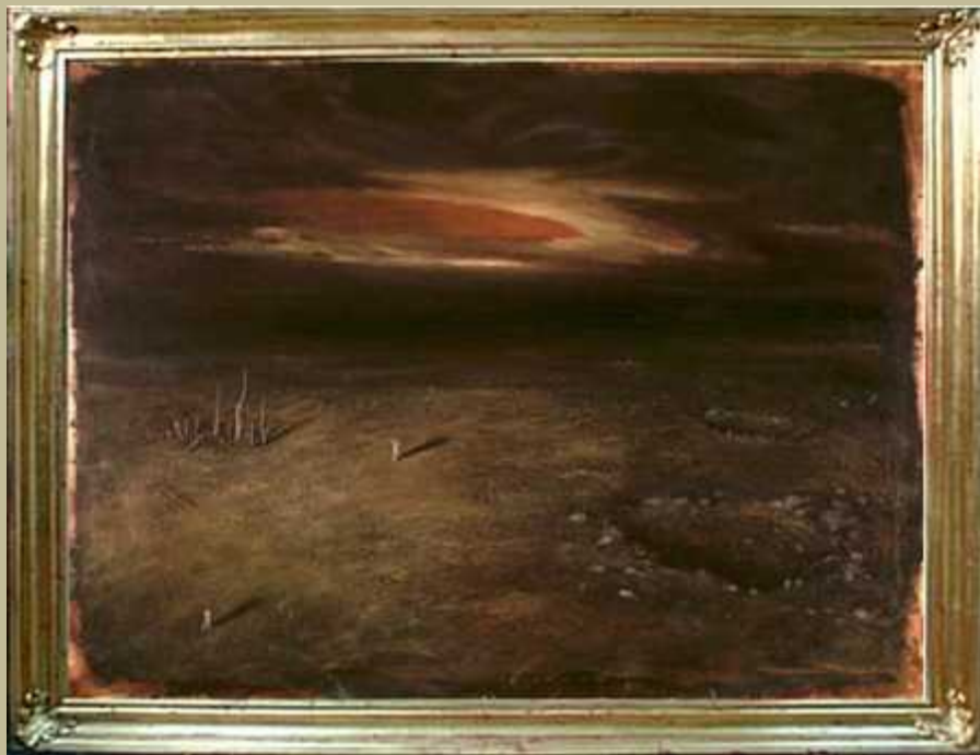
The Red Cloud , 1998, oil & beeswax on plywood, 36 x 48 inches

This painting, The Red Cloud , ( see detail ) was included in the 41st Delta Exhibition of Painting & Sculpture at the Arkansas Arts Center, Little Rock, Arkansas, in 1998, but got only a lousy Honorable Mention by juror Peter Frank, editor of Visions art quarterly and art critic for the Los Angeles Weekly .