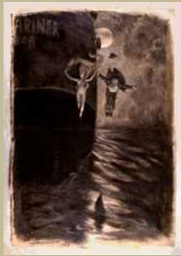
Double Indemnity 2 , 1999, charcoal, oil & beeswax on paper, 48 x 36 inches