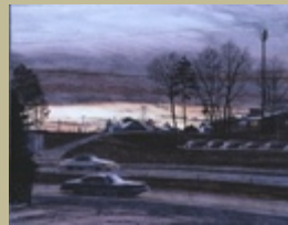
View from Ward Motel, 1983, watercolor on paper, 6 x 9 inches