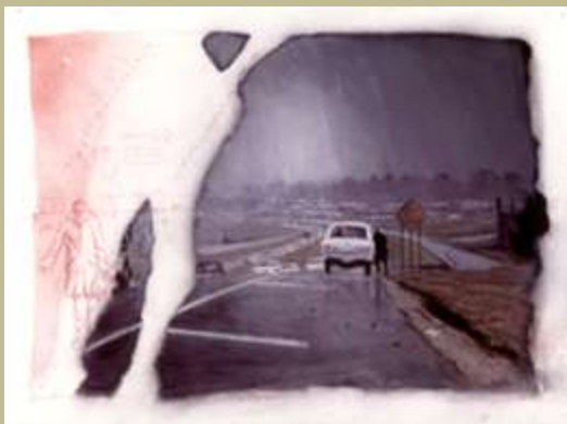
The Navigator , 1987, pastel on paper, 30 x 40 inches, collection Arkansas Arts Center Foundation

“Body and Soul: Contemporary Southern Figures,” organized by The Columbus Museum, Columbus, Georgia. The show toured four museums in 1997 & 1998: The Columbus Museum, The Mobile Museum of Art, Mobile, Alabama, The Mississippi Museum of Art, Jackson, Mississippi, and The Cummer Museum of Art, Jacksonville, Florida.