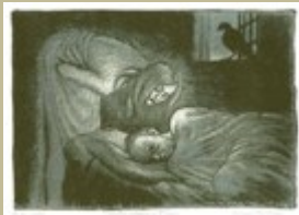
Death Waking Time, 2000, linocut