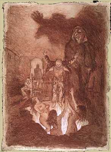
Study for Don Giovanni Impenitente , 1999, red chalk on paper, 22½ x 16 inches