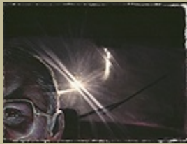
Eye & Headlights, 1987, pastel, 22½ x 30 inches

This invitational show featured the human figure as seen from several angles by several Arkansas artists. My painting, The Red Cloud and four other smaller works were included.