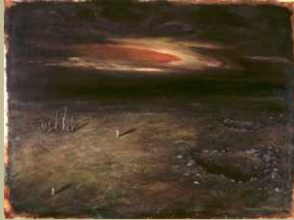
The Red Cloud (A Man Following a Woman), 1998, oil on wood, 36 x 48 inches