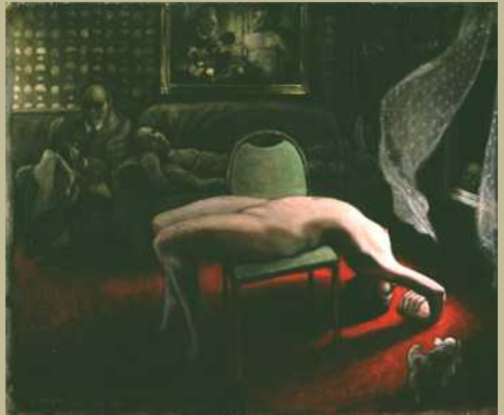
Therapy I: The Voyeur , 1999, oil on wood, 20 x 24 inches

This painting, Therapy I: The Voyeur , received a Delta Award in The 42nd Delta Exhibition of Painting and Sculpture at the Arkansas Arts Center, Little Rock, Arkansas, July through September, 1999.