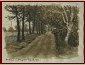
West Pathway Road, Late Afternoon, 2000, ink on paper, 6 x 9 inches