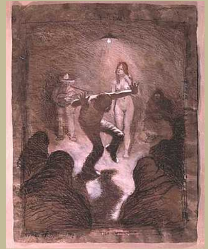
The Samaqueca , 1999, conté & oil on bark paper, 30 x 22½ inches