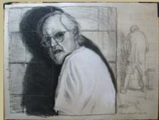
A Man Pissing, 2001, charcoal & pastel on paper, 22 x 30 inches