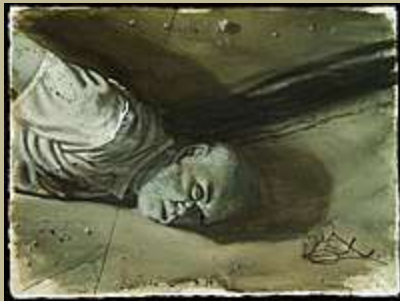
Self Portrait, Dead , 2003, sumi on paper, 23 x 30 inches

Arkansas Arts Council Fellowship Award Exhibition Gallery I, University of Arkansas at Little Rock May 19 - July 3