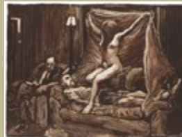
Therapy II: The Yellow Veil, 2000, monotype

The Wichita Center for the Arts, Wichita, KS. See "The Works of Warren Criswell," an illustrated essay on this show by the artist