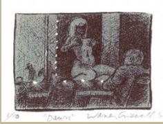
Dawn, 2000, linocut, image 1¾ x 2¼ in.