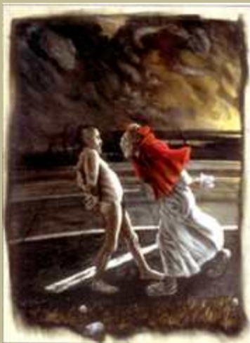
The Storm, 1992, oil on linen, 48 x 36 inches