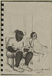
Girls in the Waiting Room, 6/1/01, ink on gray laid paper, 6 x 8 in.

Henderson State University, Arkadelphia, AR: "New Linocuts" (January, February)