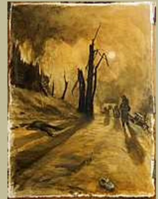
Driveway III , 2003, sumi & pastel on paper, 30 x 23 inches

Arkansas Arts Council Fellowship Award Exhibition Gallery I, University of Arkansas at Little Rock May 19 - July 3