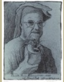
Leonardo Pisano, Fibonacci, 2000, linocut, 7 x 5 inches

Although I didn't actually grow up in Arkansas, I had several drawings and linocuts in this first showing of the Central Arkansas Library's new collection, curated by Arkansas Art Coordinator Reita Miller.