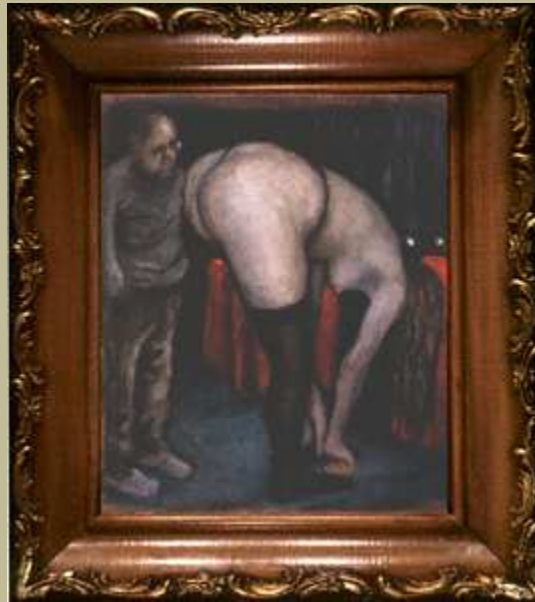
Black Stockings VIII, 1999, oil on hardwood, 12 x 10 inches

University of Arkansas at Little Rock, AR Taylor's Contemporanea, Hot Springs, AR