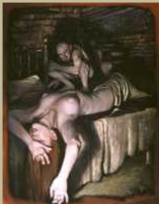
Incubus, 1998, oil & beeswax on plywood, 36 x 28 inches

Incubus , Warren's ripoff of Fuseli's The Nightmare , was included in the exhibition Appropriation: Art About Art , 1999, in Gallery 1, Fine Arts Building, University of Arkansas at Little Rock.